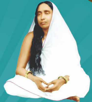
Maa Sharda (All teachers are one. The same power of God works through them all)