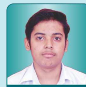
Arpit Computer Sci. LPU Punjab