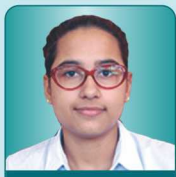
Physics Hons. Hindu College Delhi Univ.