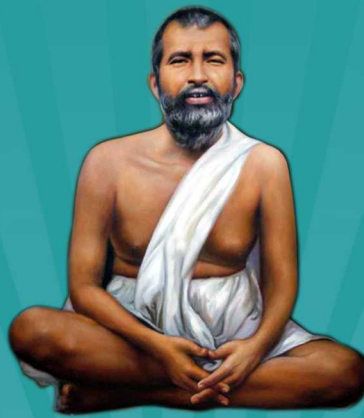
Swami Ramkrishan Paramhans (The Goal of Human Life is God's Realisation)