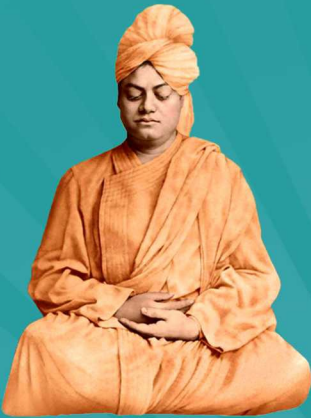
Swami Vivekananda (All power is within you; you can do anything and everything)

From nature springs curiosity, curiosity causes exploration, and from exploration comes knowledge. Knowledge is the seed for creation and creation is the aspiration of all human endeavours. Knowledge never dies and nor can it be deformed. It is immortal and its quest is the true path for salvation.