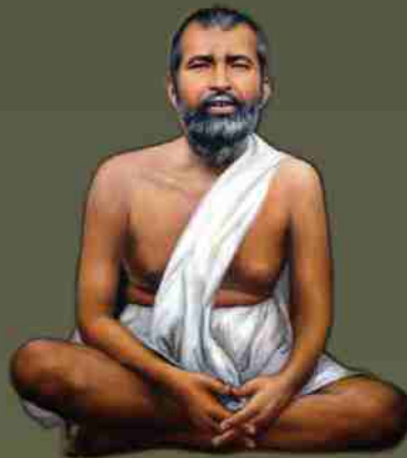
Swami Ramkrishan Paramhans (The Goal of Human Life is God's Realisation)