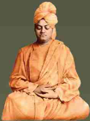
Swami Vivekananda (The Paramhans of Saint Ramkrishan)

From nature springs curiosity, curiosity causes exploration, and from exploration comes knowledge. Knowledge is the seed for creation and creation is the aspiration of all human endeavours. Knowledge never dies and nor can it be deformed. It is immortal and its quest is the true path for salvation.