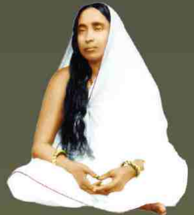
Maa Sharda (All teachers are one. The same power of God works through them all)